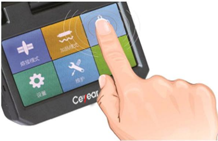
Entirely new GUI graphical interfaces and touch screen

AV6481 uses entirely new GUI and touch screen in design. Operators can set up the splicer and get to know relevant information of it simply and directly by graphical interfaces.