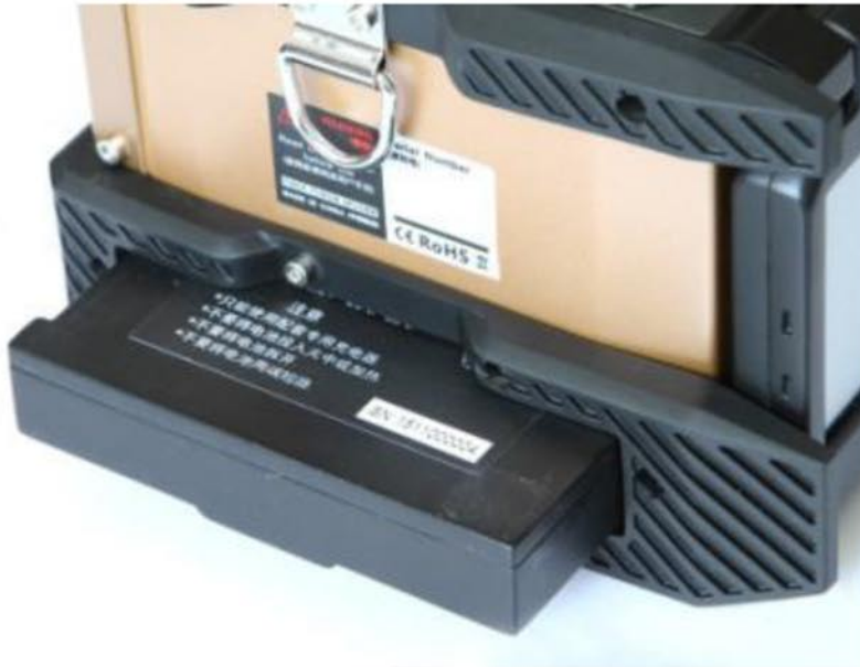
Built-in pluggable lithium battery of large-capacity

The built-in pluggable lithium-ion battery of large capacity can answer working demand lasting all day long (typical 220 counts of splicing and heating cycles).