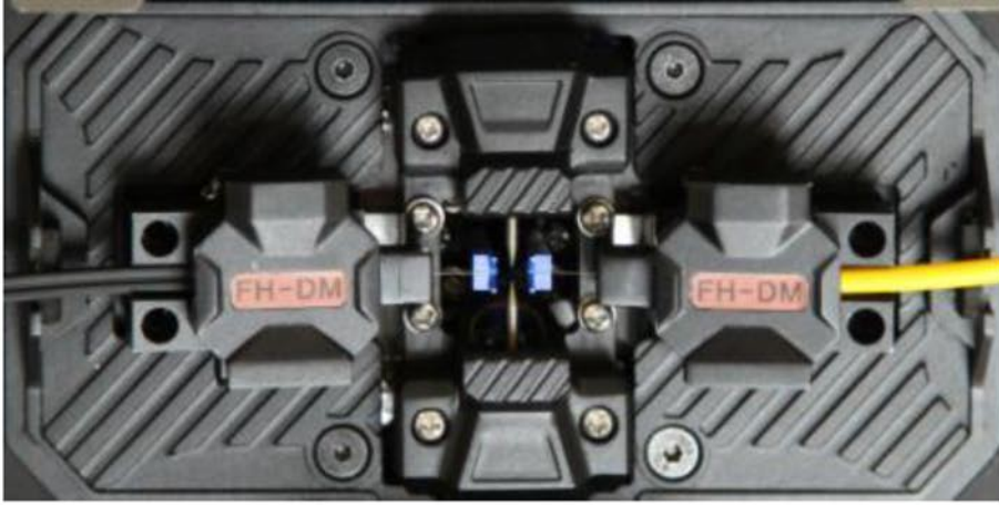
All-in-one optical fiber fixture