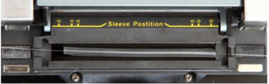
Hear and detection unit