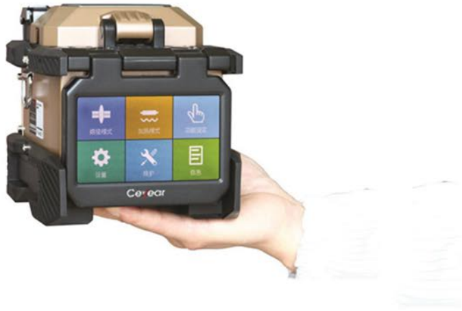
Lift by one hand

Small size and light weight, the splicer is easy to carry and can be lift by one hand.